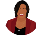
Maggie Alphonsi MBE Inspirational Speaker